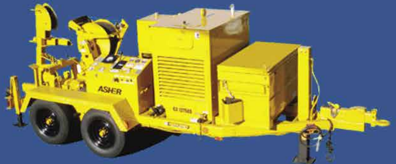
Sherman Reilly UnderDawg Bull Wheel Puller