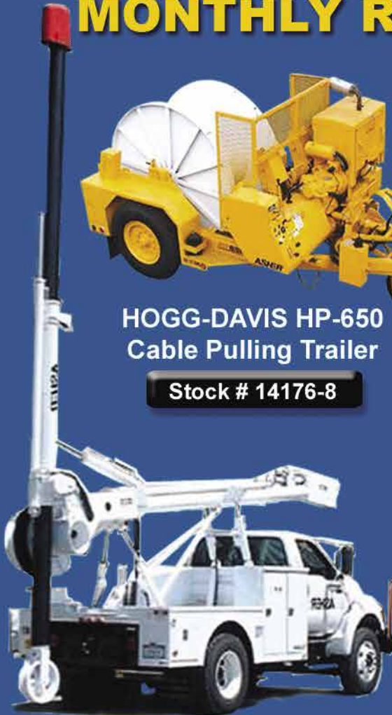
FORD Diesel Champion Cable Scraper Hi-Speed Cable Removal