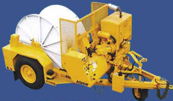
HOGG-DAVIS HP-650 Cable Pulling Trailer