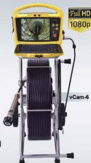
Full HD 1080p